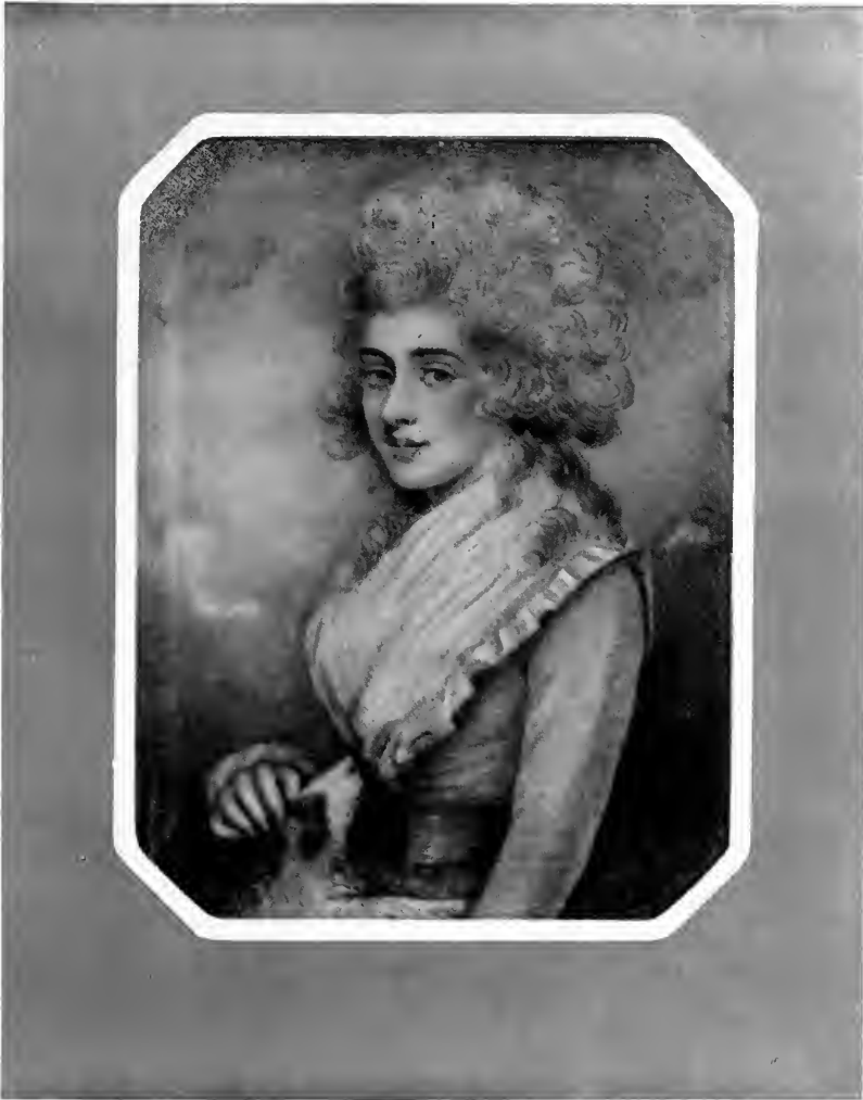
LUCY, WIFE OF WILLIAM H. NASSAU, FOURTH EARL OF ROCHFORD BY RICHARD COSWAY, R.A.